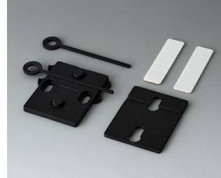
A9305019 Wall suspension elements ASA+PC (UL 94 V-0) black RAL 9005