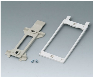
B1360048 Wall suspension elements ABS (UL 94 HB) pebble grey RAL 7032