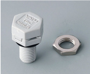
C2306917 Pressure equalisation element M6x0.75 PA 6 (UL 94 HB) light grey RAL 7035 IP 56