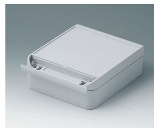
C6015181 SMART-BOX WIDTH 150 ASA+PC (UL 94 V-0) light grey RAL 7035 180x150x60mm IP 66