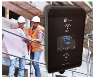
RFID card reader for construction site workers