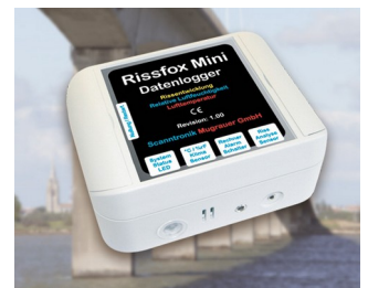
Miniature data logger for crack displacements and climatic data