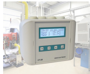
Universal temperature controller / Temperature difference controller