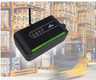
Pedestrian Alert System