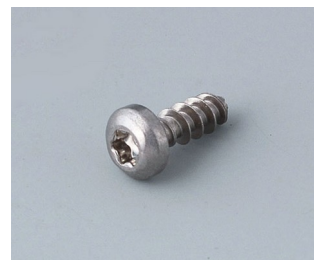
A0308132 Self-tapping screw 3 x 8 mm (T10) Stainless steel