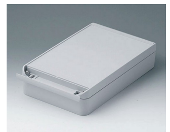
C6017281 SMART-BOX WIDTH 170 ASA+PC (UL 94 V-0) light grey RAL 7035 280x170x60mm IP 65