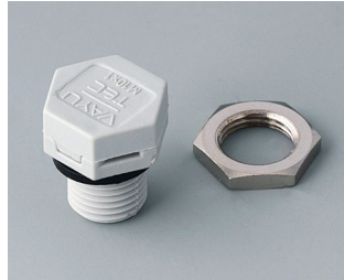
C2310917 Pressure equalisation element M10x1 PA 6 (UL 94 HB) light grey RAL 7035 IP 56