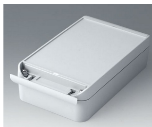
C6013221 SMART-BOX WIDTH 130 ASA+PC (UL 94 V-0) light grey RAL 7035 220x130x60mm IP 66