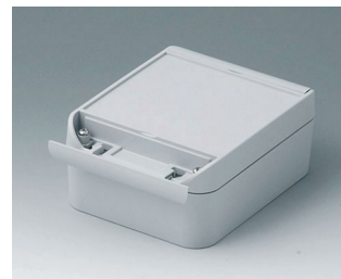
C6011141 SMART-BOX WIDTH 110 ASA+PC (UL 94 V-0) light grey RAL 7035 140x110x60mm IP 66