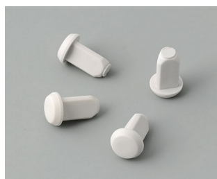
C2299018 Case feet TPE (UL 94 HB)