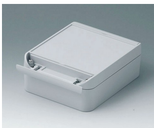
C6013161 SMART-BOX WIDTH 130 ASA+PC (UL 94 V-0) light grey RAL 7035 160x130x60mm IP 66