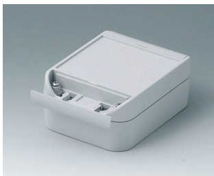
C6009121 SMART-BOX WIDTH 90 ASA+PC (UL 94 V-0) light grey RAL 7035 120x90x50mm IP 66