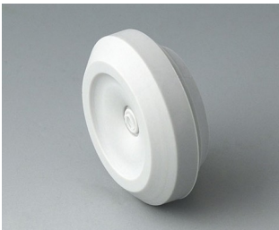
C2320147 Cable grommet TPE light grey RAL 7035 IP 67