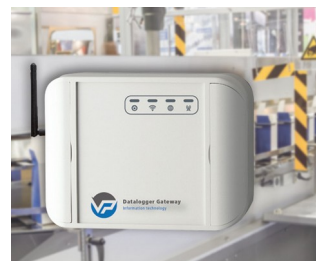
Data logger for machine monitoring