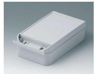
C6011201 SMART-BOX WIDTH 110 ASA+PC (UL 94 V-0) light grey RAL 7035 200x110x60mm IP 66