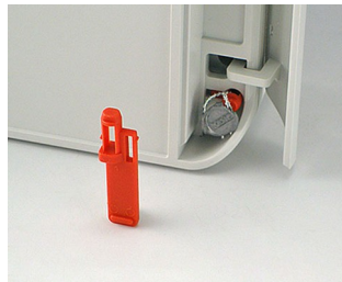
C6100006 Security plug PA 6 red