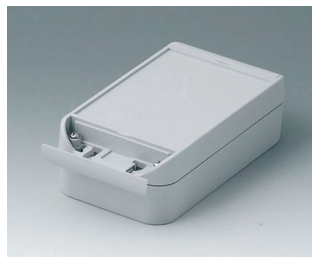
C6009161 SMART-BOX WIDTH 90 ASA+PC (UL 94 V-0) light grey RAL 7035 160x90x50mm IP 66