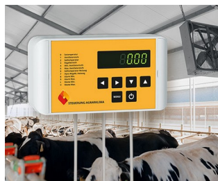
Agricultural climate Control