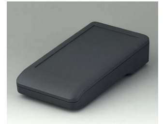
A9006118 DATEC-COMPACT M ASA+PC (UL 94 V-0) lava 172x92x39mm IP 41