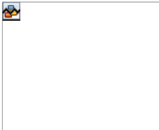
Analysing water quality

Flexible machine control systems in production and assembly. Terminals for programming and teach-in applications. Classic applications in the field of electrical engineering and electronics, e.g. measurement and control equipment. Mobile terminals, programmers, data collection units and much more.