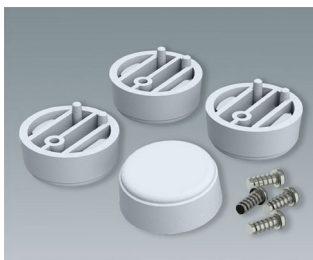
A9257405 Case feet, Vers. I ABS (UL 94 HB) light grey RAL 7035 ø30x12mm