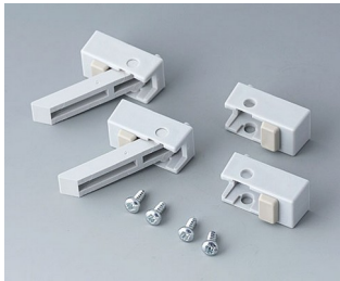
A9257205 Case feet, Vers. II ABS (UL 94 HB) light grey RAL 7035