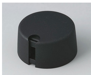
A1031069 TOP-KNOBS 31 PA 6 nero 31x16mm 6mm