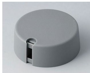
A1040048 TOP-KNOBS 40 PA 6 volcano 40x16mm 4mm