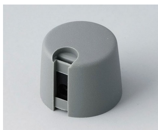
A1020068 TOP-KNOBS 20 PA 6 volcano 20x16mm 6mm