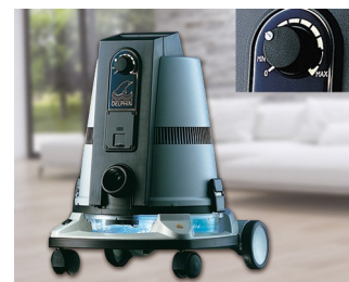
Operating element for a vacuum cleaner