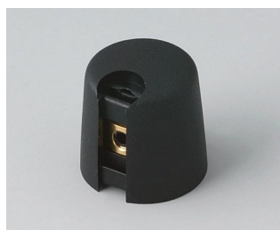
A1016049 TOP-KNOBS 16 PA 6 nero 16x16mm 4mm