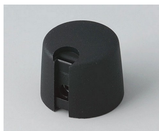
A1020069 TOP-KNOBS 20 PA 6 nero 20x16mm 6mm