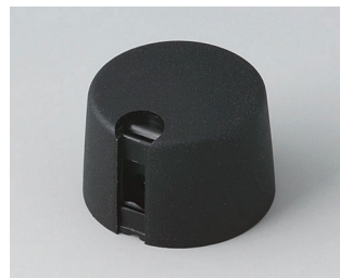
A1024049 TOP-KNOBS 24 PA 6 nero 24x16mm 4mm