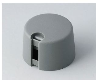
A1024068 TOP-KNOBS 24 PA 6 volcano 24x16mm 6mm