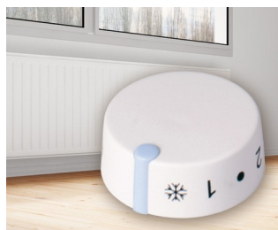
Integrated thermostat for electric storage heaters