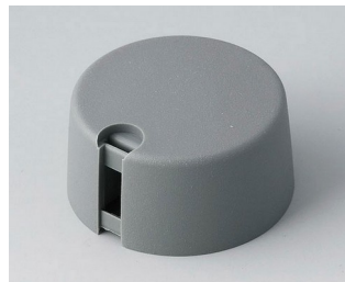
A1031048 TOP-KNOBS 31 PA 6 volcano 31x16mm 4mm