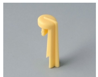
A1105004 Arrow PA 6 (UL 94 HB) beach