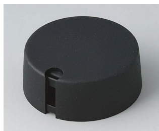
A1040069 TOP-KNOBS 40 PA 6 nero 40x16mm 6mm