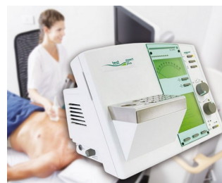
Operating element for a diagnostic device