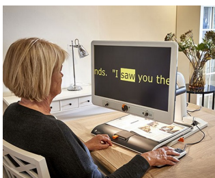
Control knobs for video magnifier