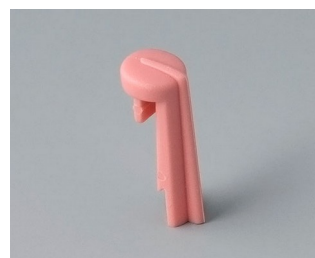
A1105003 Arrow PA 6 (UL 94 HB) coral