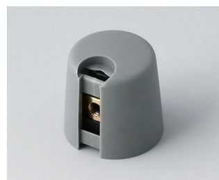
A1016068 TOP-KNOBS 16 PA 6 volcano 16x16mm 6mm