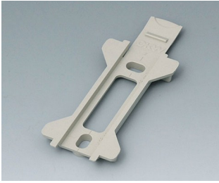
B1350028 Wall suspension element for Toptec 123 PC+ABS (UL 94 V-0) pebble grey RAL 7032