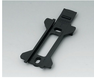
B1350029 Wall suspension element for Toptec 123 ABS (UL 94 HB) black RAL 9005