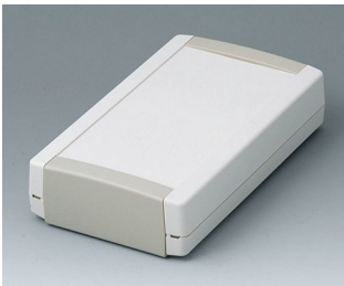
B1075365 TOPTEC 194 F, Vers. I ABS (UL 94 HB) off-white RAL 9002 194x115x46mm IP 40