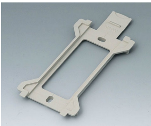
B1370028 Wall suspension element for Toptec 194 PC+ABS (UL 94 V-0) pebble grey RAL 7032