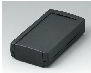
B1055369 TOPTEC 123 F, Vers. I ABS (UL 94 HB) black RAL 9005 123x68x30mm IP 40