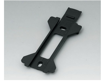
B1360029 Wall suspension element for Toptec 154 ABS (UL 94 HB) black RAL 9005