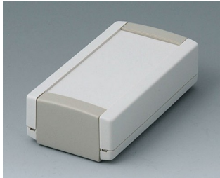
B1040365 TOPTEC 102, Vers. I ABS (UL 94 HB) off-white RAL 9002 102x54x30mm IP 40