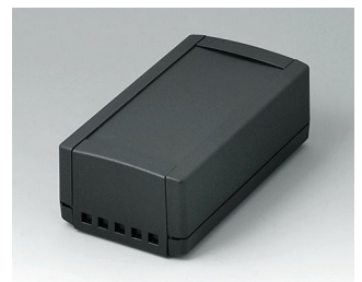
B1060469 TOPTEC 154 H, Vers. II ABS (UL 94 HB) black RAL 9005 154x84x56mm IP 40