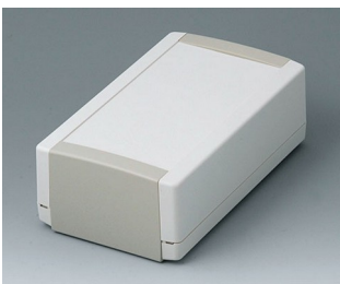
B1070365 TOPTEC 194 H, Vers. I ABS (UL 94 HB) off-white RAL 9002 194x115x68mm IP 40