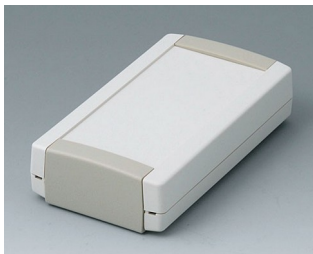
B1055365 TOPTEC 123 F, Vers. I ABS (UL 94 HB) off-white RAL 9002 123x68x30mm IP 40