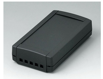
B1055469 TOPTEC 123 F, Vers. II ABS (UL 94 HB) black RAL 9005 123x68x30mm IP 40