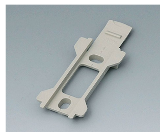
B1340028 Wall suspension element for Topotec 102 PC+ABS (UL 94 V-0) pebble grey RAL 7032