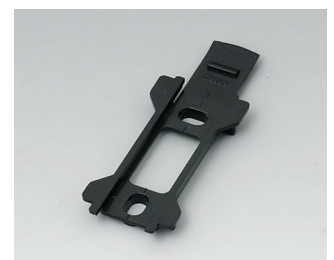
B1340029 Wall suspension element for Topotec 102 ABS (UL 94 HB) black RAL 9005