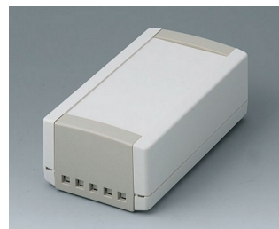
B1060465 TOPTEC 154 H, Vers. II ABS (UL 94 HB) off-white RAL 9002 154x84x56mm IP 40