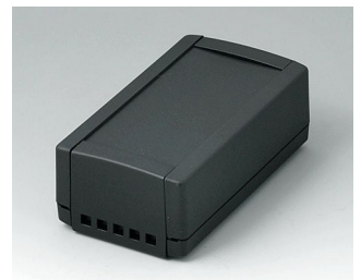
B1050469 TOPTEC 123 H, Vers. II ABS (UL 94 HB) black RAL 9005 123x68x45mm IP 40