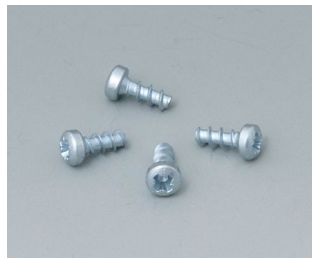
A9199008 Set of screws