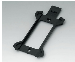
B1370029 Wall suspension element for Toptec 194 ABS (UL 94 HB) black RAL 9005