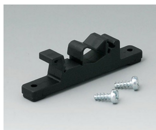
B1300019 Fastening element for DIN-Rails PA 6 black RAL 9005