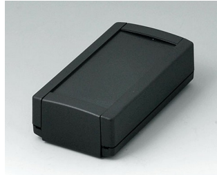
B1040369 TOPTEC 102, Vers. I ABS (UL 94 HB) black RAL 9005 102x54x30mm IP 40