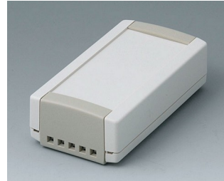
B1040465 TOPTEC 102, Vers. II ABS (UL 94 HB) off-white RAL 9002 102x54x30mm IP 40