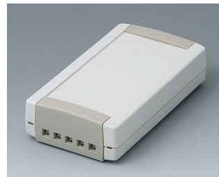
B1055465 TOPTEC 123 F, Vers. II ABS (UL 94 HB) off-white RAL 9002 123x68x30mm IP 40