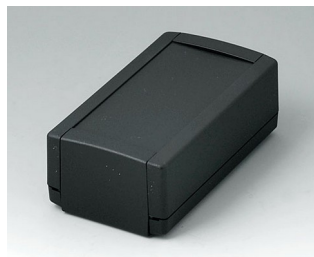
B1050369 TOPTEC 123 H, Vers. I ABS (UL 94 HB) black RAL 9005 123x68x45mm IP 40