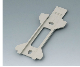
B1360028 Wall suspension element for Toptec 154 PC+ABS (UL 94 V-0) pebble grey RAL 7032