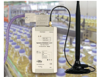
PROFIBUS radio system