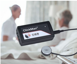
Adaptive multicontroller for single sensors

Universal enclosures for electronic and electro-technical devices. For example, monitoring purposes as check instruments, signalling equipment and control systems, medical and wellness devices, laboratory technology, computer peripherals and IoT/IIoT.