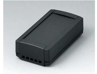
B1040469 TOPTEC 102, Vers. II ABS (UL 94 HB) black RAL 9005 102x54x30mm IP 40