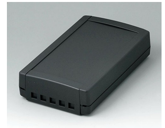
B1075469 TOPTEC 194 F, Vers. II ABS (UL 94 HB) black RAL 9005 194x115x46mm IP 40