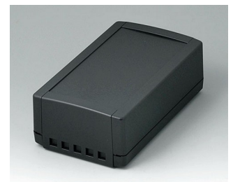
B1070469 TOPTEC 194 H, Vers. II ABS (UL 94 HB) black RAL 9005 194x115x68mm IP 40