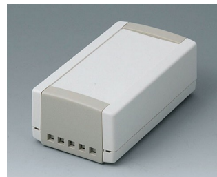
B1050465 TOPTEC 123 H, Vers. II ABS (UL 94 HB) off-white RAL 9002 123x68x45mm IP 40