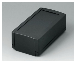
B1060369 TOPTEC 154 H, Vers. I ABS (UL 94 HB) black RAL 9005 154x84x56mm IP 40