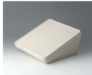
B4422107 PROTEC 220, Vers. I ASA+PC (UL 94 V-0) off-white RAL 9002 220x220x108mm IP 65 opt.