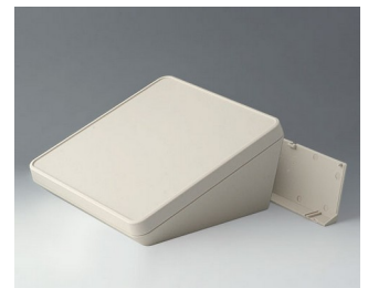
B4422207 PROTEC 220, Vers. II ASA+PC (UL 94 V-0) off-white RAL 9002 220x220x108mm IP 65 opt.