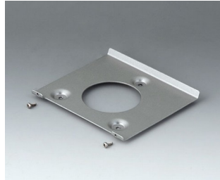
B4518101 Wall suspension element 180 Aluminium