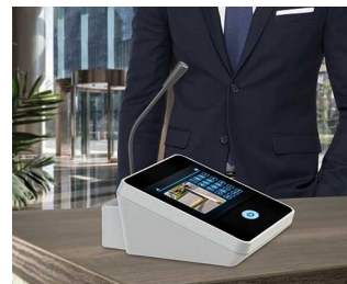
Table microphone / inter phone