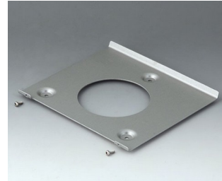
B4522101 Wall suspension element 220 Aluminium