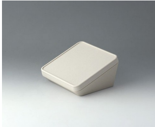
B4414107 PROTEC 140, Vers. I ASA+PC (UL 94 V-0) off-white RAL 9002 140x140x76mm IP 65 opt.