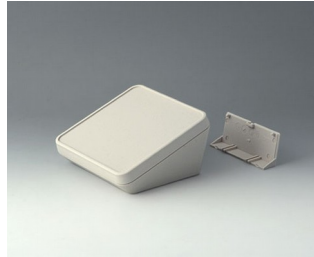
B4414207 PROTEC 140, Vers. II ASA+PC (UL 94 V-0) off-white RAL 9002 140x140x76mm IP 65 opt.