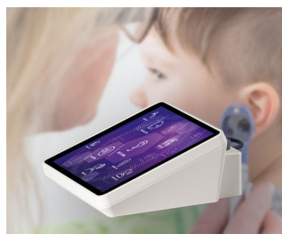
Hearing test device