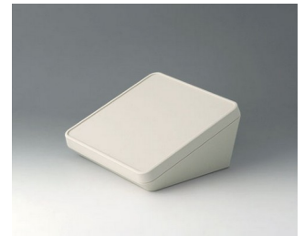
B4418107 PROTEC 180, Vers. I ASA+PC (UL 94 V-0) off-white RAL 9002 180x180x92mm IP 65 opt.