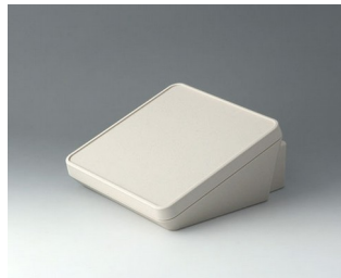
B4418307 PROTEC 180, Vers. III ASA+PC (UL 94 V-0) off-white RAL 9002 180x201x92mm IP 65 opt.