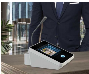
Table microphone / inter phone