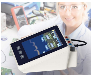
Multimeter measuring device