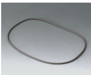
B4514030 Sealing 140