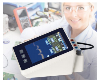
Multimeter measuring device