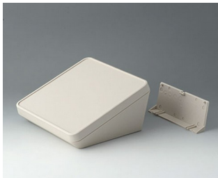
B4418207 PROTEC 180, Vers. II ASA+PC (UL 94 V-0) off-white RAL 9002 180x180x92mm IP 65 opt.