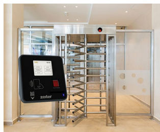
Terminal for access control