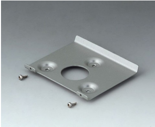
B4514101 Wall suspension element 140 Aluminium