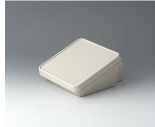
B4414307 PROTEC 140, Vers. III ASA+PC (UL 94 V-0) off-white RAL 9002 140x160x76mm IP 65 opt.