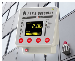
Terminal for fire alarm systems