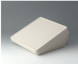
B4422307 PROTEC 220, Vers. III ASA+PC (UL 94 V-0) off-white RAL 9002 220x243x108mm IP 65 opt.