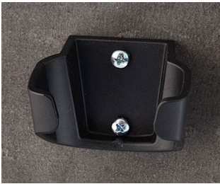
B2904039 Holder L ASA (UL 94 HB) black RAL 9005