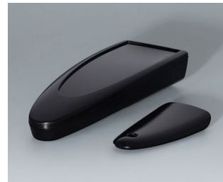
B2803016 STYLE-CASE M PMMA (IR) (UL 94 HB) black RAL 9005 147x56x27mm IP 65 opt., IP 40