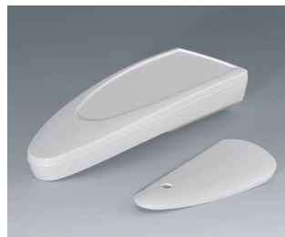
B2804017 STYLE-CASE L ASA (UL 94 HB) traffic white RAL 9016 166x64x31mm IP 65 opt., IP 40