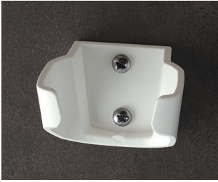
B2903037 Holder M ASA (UL 94 HB) traffic white RAL 9016