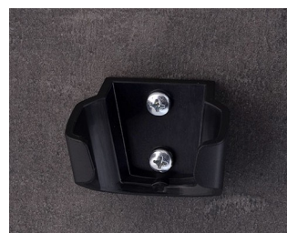
B2902039 Holder S ASA (UL 94 HB) black RAL 9005