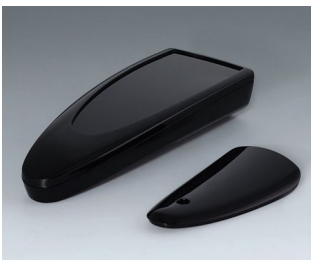
B2804016 STYLE-CASE L PMMA (IR) (UL 94 HB) black RAL 9005 166x64x31mm IP 65 opt., IP 40