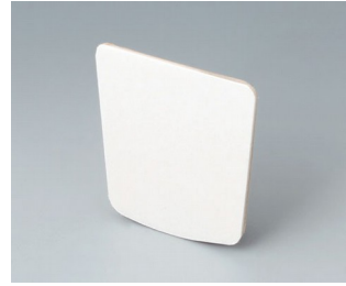
B2904031 Adhesive foil L