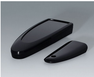
B2802016 STYLE-CASE S PMMA (IR) (UL 94 HB) black RAL 9005 123x48x24mm IP 40