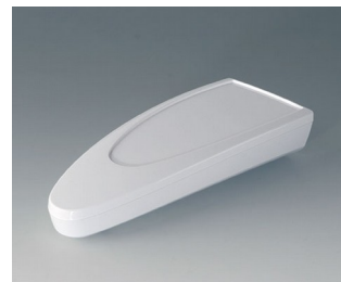
B2804027 STYLE-CASE L ASA (UL 94 HB) traffic white RAL 9016 166x64x31mm IP 65 opt., IP 40