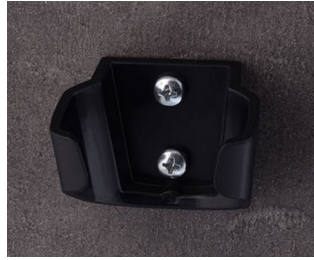
B2903039 Holder M ASA (UL 94 HB) black RAL 9005