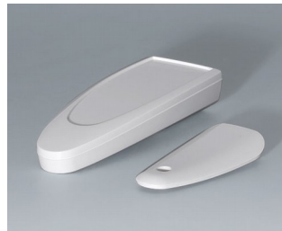
B2802017 STYLE-CASE S ASA (UL 94 HB) traffic white RAL 9016 123x48x24mm IP 40