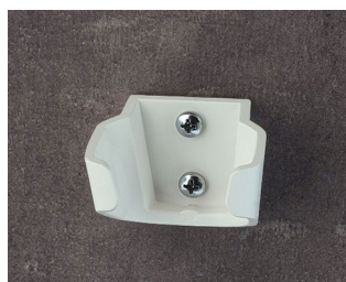
B2902037 Holder S ASA (UL 94 HB) traffic white RAL 9016