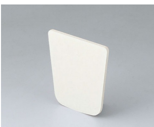
B2902031 Adhesive foil S