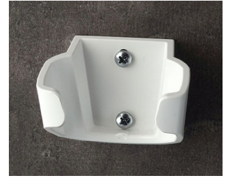
B2904037 Holder L ASA (UL 94 HB) traffic white RAL 9016