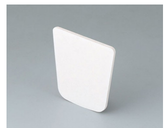
B2903031 Adhesive foil M