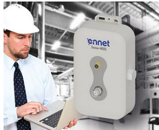
Sensor box for process monitoring