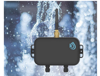
Water level monitoring