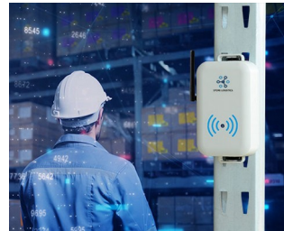
Smart store logistics