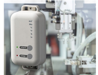
Data logger with gateway function