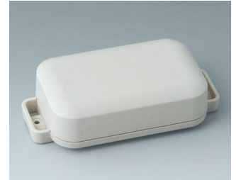
C3206207 EASYTEC 100 ASA+PC (UL 94 V-0) off-white RAL 9002 121x62x31mm IP 65 opt., IP 40