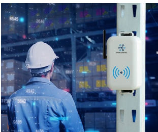
Smart store logistics