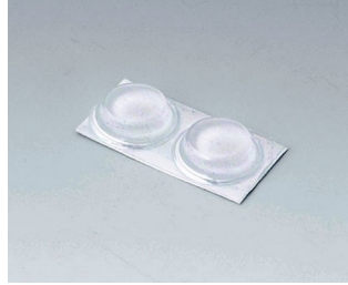
A9212330 Anti-slide feet 12 x 3.5 mm transparent

Subject to technical modification without notice. © by OKW Gehäusesysteme, Buchen/Germany.