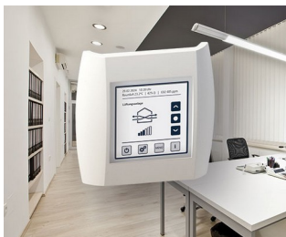
Indoor air quality control