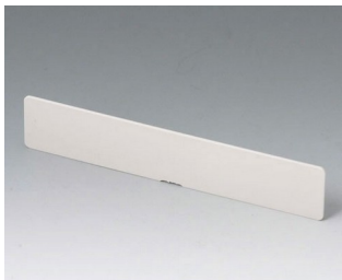
A9194007 Slot-in panel ABS (UL 94 HB) off-white RAL 9002 156x30x3mm