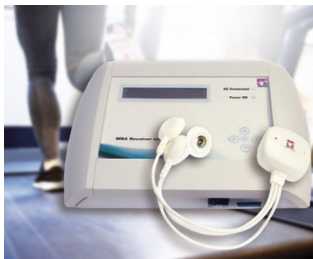
WBA receiver unit for measuring biosignals