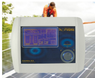
Control unit for photovoltaic solar installations