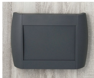
A9094108 DIATEC M ABS (UL 94 HB) lava 270x48x200mm IP 40