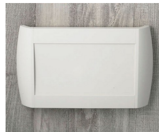
A9095107 DIATEC L ABS (UL 94 HB) off-white RAL 9002 330x48x200mm IP 40