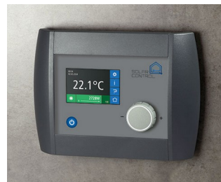
Solar Control Panel