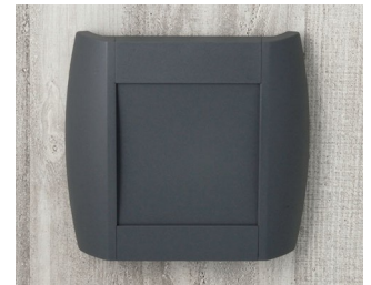
A9093108 DIATEC S ABS (UL 94 HB) lava 210x48x200mm IP 40