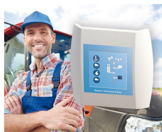
Weather Monitoring Station