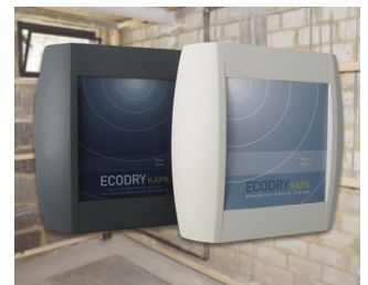
Systems for drying brickwork