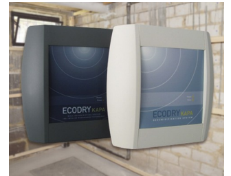
Systems for drying brickwork