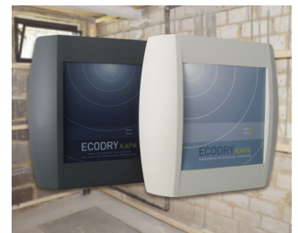
Systems for drying brickwork