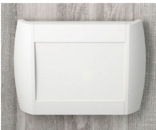
A9094107 DIATEC M ABS (UL 94 HB) off-white RAL 9002 270x48x200mm IP 40