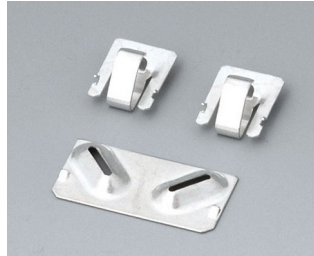
A9190002 Set of battery clips, 2xN/2xAA/2xAAA Steel tin-plated