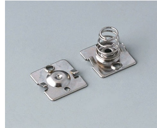
A9190015 Set of battery clips, 2 x AA Steel nickel-plated