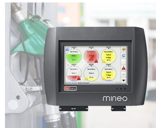
Controller for intelligent tank management