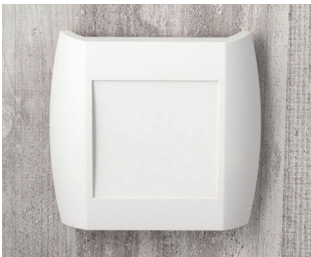
A9092107 DIATEC XS ABS (UL 94 HB) off-white RAL 9002 150x37x155mm IP 40