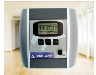
House control unit