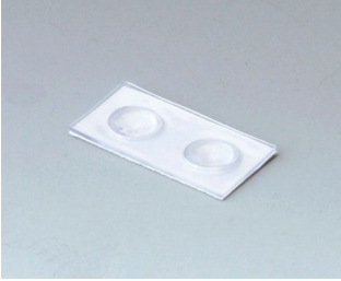
A9207150 Anti-slide feet 6.5 x 2 mm transparent