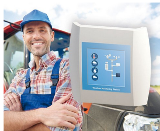
Weather Monitoring Station