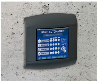
Control panel for home automation