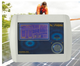
Control unit for photovoltaic solar installations