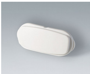
B2811207 End part ASA+PC-FR (UL 94 V-0) off-white RAL 9002