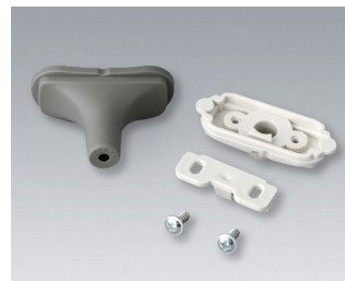
B2911308 Cable gland kit, 3.4 - 4.2 SEBS (TPE) volcano