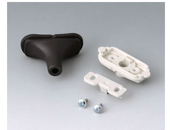
B2911329 Cable gland kit, 5.0 - 5.9 TPE black RAL 9005