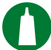
Installation / Assembly of accessories