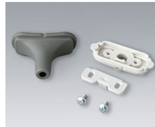
B2911328 Cable gland kit, 5.0 - 5.9 TPE volcano