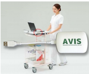
Receiver and data transfer for EMR