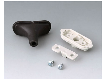
B2911329 Cable gland kit, 5.0 - 5.9 TPE black RAL 9005