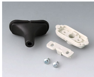
B2911319 Cable gland kit, 4.2 - 5.0 TPE black RAL 9005