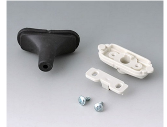
B2911309 Cable gland kit, 3.4 - 4.2 TPE black RAL 9005