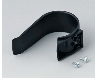
A9167029 Holding clamp PA 6 (UL 94 HB) black RAL 9005