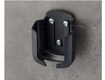
B2931509 Holder ASA+PC-FR (UL 94 V-0) black RAL 9005