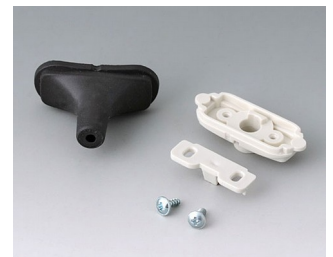
B2911309 Cable gland kit, 3.4 - 4.2 SEBS (TPE) black RAL 9005