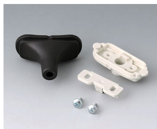
B2911319 Cable gland kit, 4.2 - 5.0 SEBS (TPE) black RAL 9005