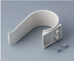
A9167027 Holding clamp PA 6 (UL 94 HB) off-white RAL 9002