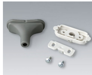
B2911328 Cable gland kit, 5.0 - 5.9 TPE volcano