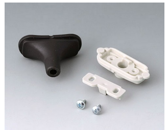
B2911329 Cable gland kit, 5.0 - 5.9 TPE black RAL 9005