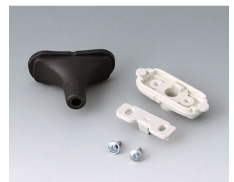
B2911329 Cable gland kit, 5.0 - 5.9 SEBS (TPE) black RAL 9005