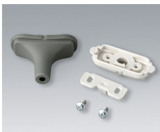
B2911318 Cable gland kit, 4.2 - 5.0 SEBS (TPE) volcano