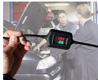
Voltage and current display during trickle charging