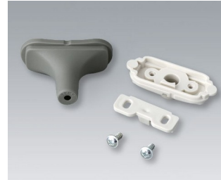
B2911308 Cable gland kit, 3.4 - 4.2 TPE volcano