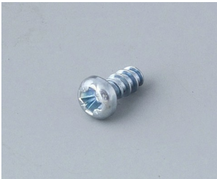
A0304031 Self-tapping screws 2.2 x 5 mm (PZ1)

Subject to technical modification without notice. © by OKW Gehäusesysteme, Buchen/Germany.