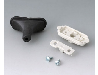
B2911309 Cable gland kit, 3.4 - 4.2 TPE black RAL 9005