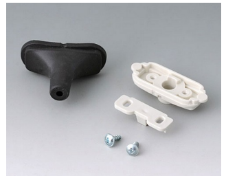
B2911309 Cable gland kit, 3.4 - 4.2 TPE black RAL 9005