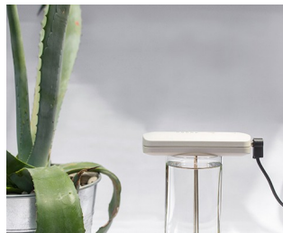
Tool for making colloidal silver solutions