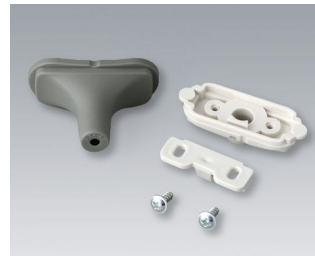
B2911308 Cable gland kit, 3.4 - 4.2 TPE volcano