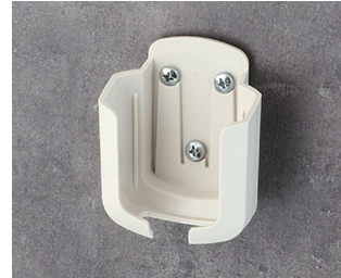
B2931507 Holder ASA+PC-FR (UL 94 V-0) off-white RAL 9002