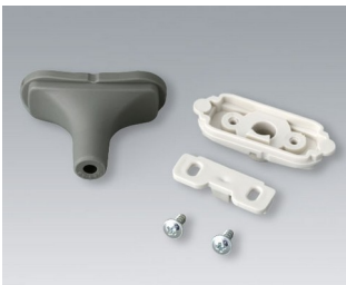
B2911318 Cable gland kit, 4.2 - 5.0 TPE volcano