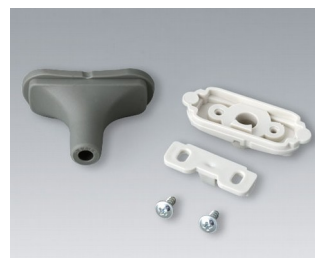
B2911328 Cable gland kit, 5.0 - 5.9 SEBS (TPE) volcano