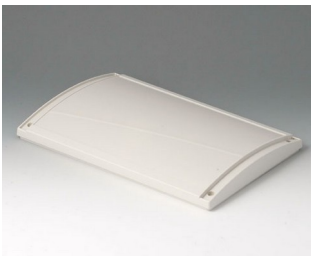
B4026637 Cover SL, convex ABS (UL 94 HB) off-white RAL 9002 263x180x28mm