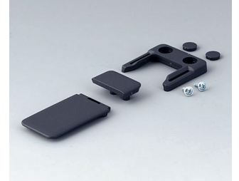
A9152048 Combi-Clip ABS (UL 94 HB) lava 45x27mm