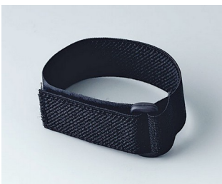
B9100033 Wrist strap black 280mm