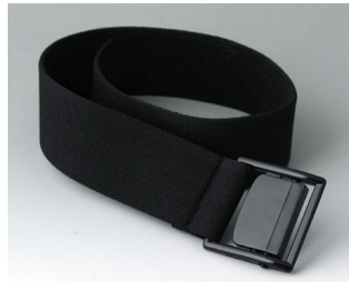
B7110129 Belt strap black 450x35mm