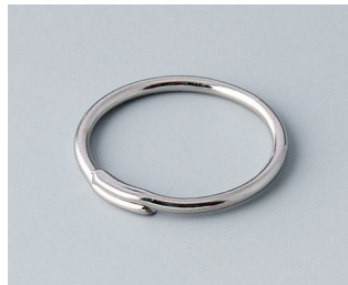
A9164001 Key ring Steel nickel-plated 20.5mm