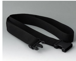
B7110139 Belt strap black 1200x30mm