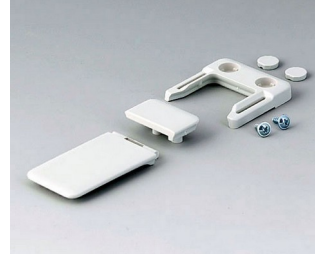
A9152047 Combi-Clip ABS (UL 94 HB) off-white RAL 9002 45x27mm