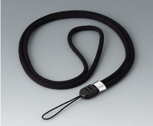
B9100063 Carrying strap, textile lanyard black 860mm

Subject to technical modification without notice. © by OKW Gehäusesysteme, Buchen/Germany.