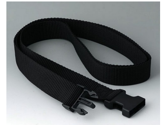
B7110149 Belt strap black 1500x30mm