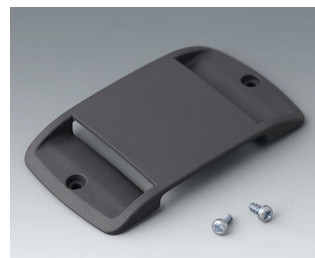
B9106128 Strap eyelet ABS (UL 94 HB) lava