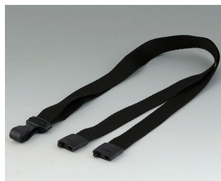
B9100073 Carrying strap, textile lanyard black 914x16mm