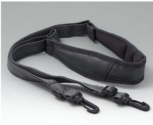
B4308650 Shoulder strap grey 1400mm