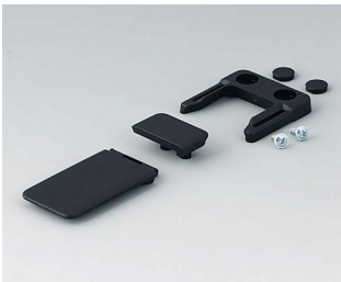
A9152049 Combi-Clip ABS (UL 94 HB) black RAL 9005 45x27mm