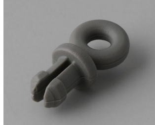
A9100002 Ring eyelet PA 6 volcano