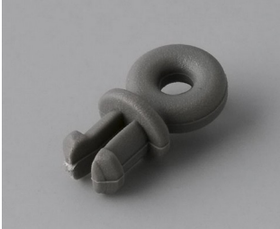
A9100001 Ring eyelet PA 6 volcano