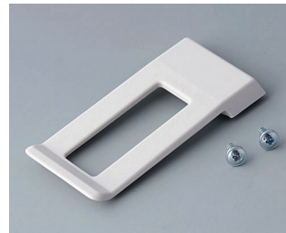
A9172107 Belt/Pocket clip ABS (UL 94 HB) off-white RAL 9002 62x30mm