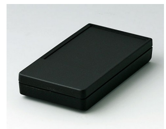
A9070119 DATEC-POCKET-BOX S ABS (UL 94 HB) black RAL 9005 85x46x16mm IP 54