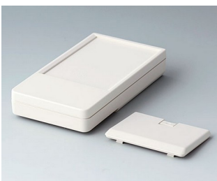
A9072127 DATEC-POCKET-BOX L ABS (UL 94 HB) off-white RAL 9002 120x65x22mm IP 41