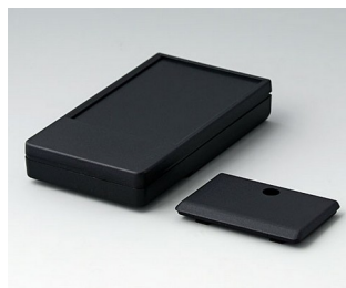
A9071119 DATEC-POCKET-BOX M ABS (UL 94 HB) black RAL 9005 105x58x18.5mm IP 54