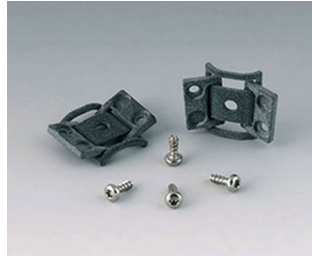
C8100360 Internal hinge set