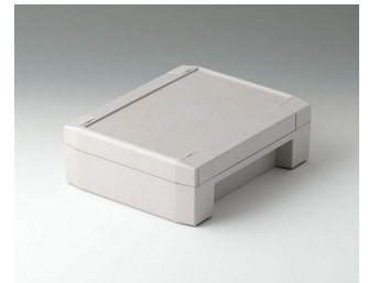
C8014182 SOLID-BOX 145 PC+ABS (UL 94 V-0) light grey RAL 7035 180x145x60mm IP 66, IP 67, IK 08