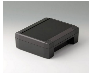
C8014181 SOLID-BOX 145 PC+ABS (UL 94 V-0) anthracite grey RAL 7016 180x145x60mm IP 66, IP 67, IK 08