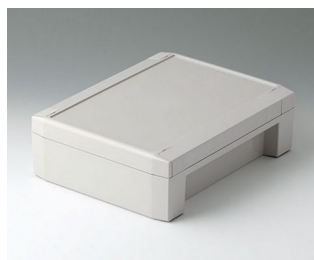
C8017222 SOLID-BOX 175 PC+ABS (UL 94 V-0) light grey RAL 7035 225x175x70mm IP 66, IP 67, IK 08