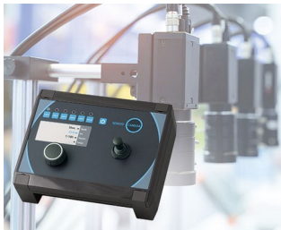
Camera control in production