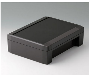
C8017221 SOLID-BOX 175 PC+ABS (UL 94 V-0) anthracite grey RAL 7016 225x175x70mm IP 66, IP 67, IK 08