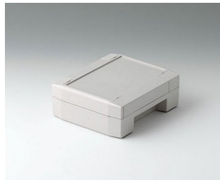
C8011132 SOLID-BOX 115 PC+ABS (UL 94 V-0) light grey RAL 7035 135x115x50mm IP 66, IP 67, IK 08