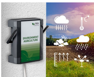
Weather station in agriculture