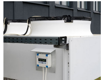
Heating/air conditioning/ventilation control