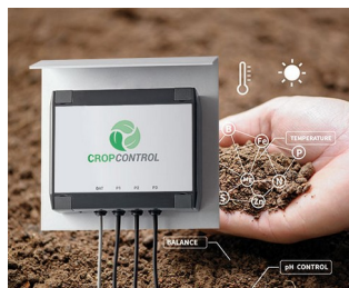
Smart Farming - system for long- term measurements