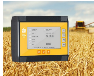
Data recording for harvesters