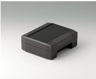
C8011131 SOLID-BOX 115 PC+ABS (UL 94 V-0) anthracite grey RAL 7016 135x115x50mm IP 66, IP 67, IK 08