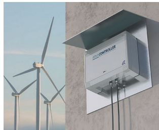
Controller wind turbines