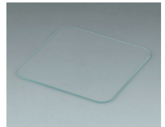
C6502013 Glass panel S84 Glass clear 78.75x78.75x1.6mm