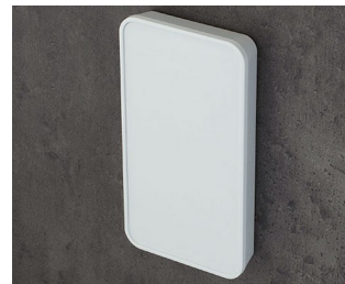
C6406107 SMART-PANEL E155 ASA+PC (UL 94 V-0) traffic white RAL 9016 155x84x21.3mm IP 40