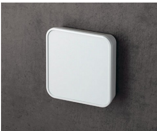
C6402107 SMART-PANEL S84 ASA+PC (UL 94 V-0) traffic white RAL 9016 84x84x21.3mm IP 40