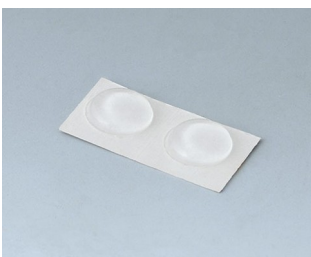
A9210180 Anti-slide feet 10,1 x 1.8 mm transparent