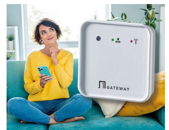
Smart home gateway