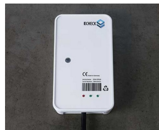
Wired device in the IIoT