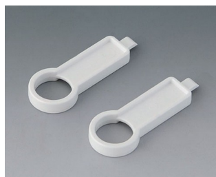
C6502010 Opening tool set ASA+PC (UL 94 V-0) traffic white RAL 9016