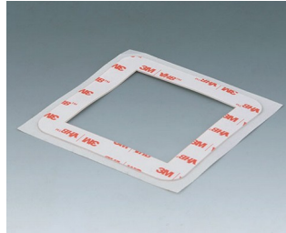
C6502012 Adhesive foil S84