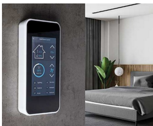
SMART-HOME control centre