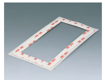
C6506012 Adhesive foil E155