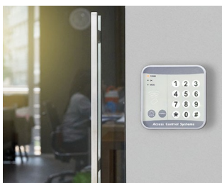
Access control system

Ideal for stationary electronics applications indoors: building services systems, electrical installation, SMART-HOME, IoT/IIoT, office, wireless communication, measuring and control technology, medical and laboratory technology, healthcare, security technology, etc.