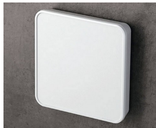
C6404107 SMART-PANEL S114 ASA+PC (UL 94 V-0) traffic white RAL 9016 114x114x21.3mm IP 40