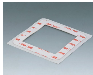
C6502012 Adhesive foil S84