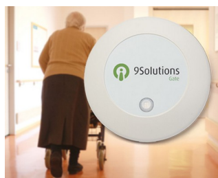
Access management in care facilities