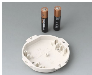
B5111107 Battery compartment, 2 x AAA ABS (UL 94 HB) off-white RAL 9002