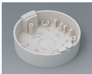
B5011117 Base ABS (UL 94 HB) off-white RAL 9002