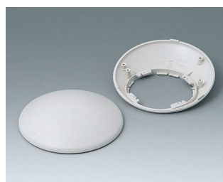
B5010307 Bottom and top part R110 H ABS (UL 94 HB) off-white RAL 9002 ø110x41mm