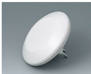
B5011027 ART-CASE R110 F PC+ABS (UL 94 V-0) off-white RAL 9002 ø110x30mm IP 40