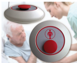
Radio paging mushroom-type button