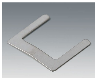
A9166002 Battery contact, 2 x AAA Steel tin-plated