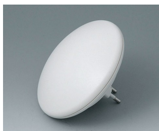
B5011127 ART-CASE R110 H PC+ABS (UL 94 V-0) off-white RAL 9002 ø110x38mm IP 40