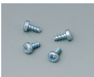
B5111201 Set of screws