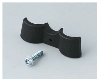
A9166003 Battery holder, 2 x AAA PA 6 (UL 94 HB) black RAL 9005