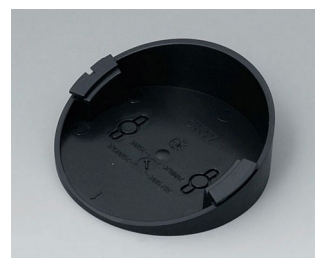
B5011219 Base 30° ABS (UL 94 HB) black RAL 9005