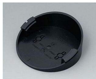
B5011219 Base 30° ABS (UL 94 HB) black RAL 9005