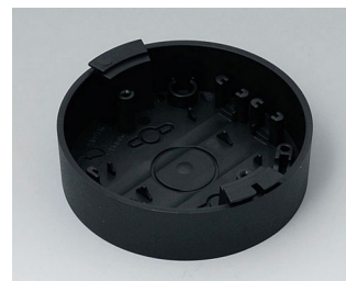
B5011119 Base ABS (UL 94 HB) black RAL 9005