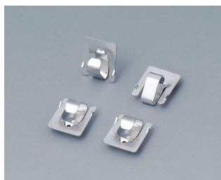
A9166001 Set of battery clips, 2 x AAA Steel tin-plated