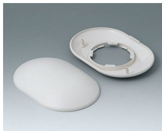
B5015107 Bottom and top part O160 H ABS (UL 94 HB) off-white RAL 9002 160x110x38mm