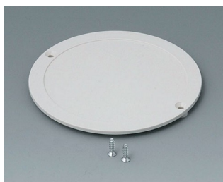
B5011857 Battery compartment lid ABS (UL 94 HB) off-white RAL 9002