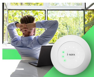
CO2 sensor traffic light