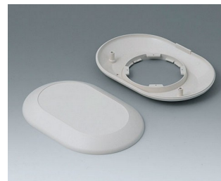
B5015007 Bottom and top part O160 F ABS (UL 94 HB) off-white RAL 9002 160x110x30mm