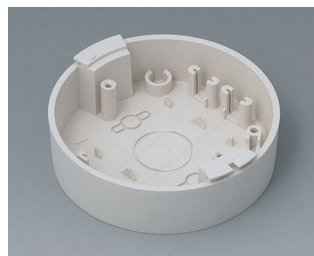
B5011117 Base ABS (UL 94 HB) off-white RAL 9002