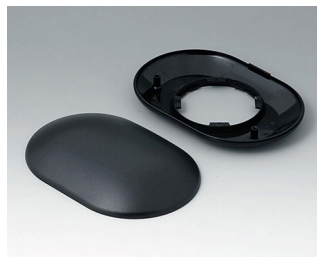
B5015109 Bottom and top part O160 H ABS (UL 94 HB) black RAL 9005 160x110x38mm