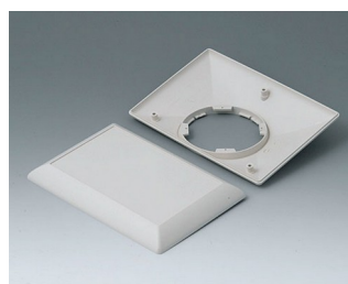
B5017207 Bottom and top part E160 F ABS (UL 94 HB) off-white RAL 9002 160x110x38mm