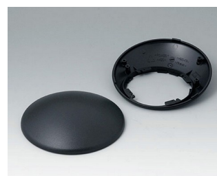
B5010309 Bottom and top part R110 H ABS (UL 94 HB) black RAL 9005 ø110x41mm