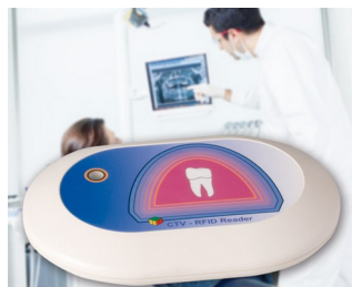
RFID Reader for the CTV system