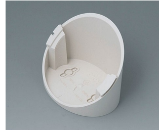
B5011317 Base 55° ABS (UL 94 HB) off-white RAL 9002