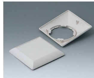
B5012207 Bottom and top part S110F ABS (UL 94 HB) off-white RAL 9002 110x110x38mm