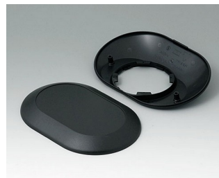
B5015209 Bottom and top part O160 F ABS (UL 94 HB) black RAL 9005 160x110x38mm