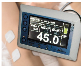
3D angle measurement of articulation systems on a gravity basis

专门为室内的电气和电子应用设计，例如，建筑行业 and 家用技术的传输和接收单元，医疗技术，保健行业，计算机外围设备，网络技术，安全技术等