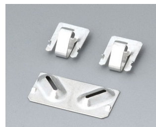
A9190002 Set of battery clips, 2xN/2xAA/2xAAA Steel tin-plated