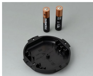
B5111109 Battery compartment, 2 x AAA ABS (UL 94 HB) black RAL 9005