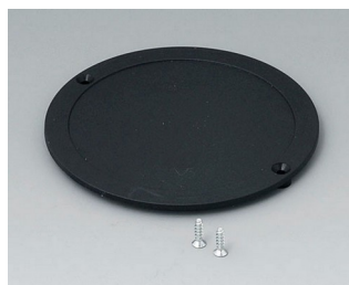
B5011859 Battery compartment lid ABS (UL 94 HB) black RAL 9005