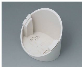
B5011317 Base 55° ABS (UL 94 HB) off-white RAL 9002