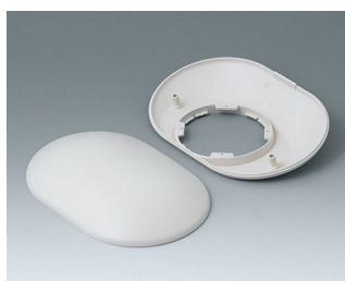
B5015307 Bottom and top part O160 H ABS (UL 94 HB) off-white RAL 9002 160x110x41mm