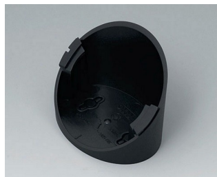
B5011319 Base 55° ABS (UL 94 HB) black RAL 9005