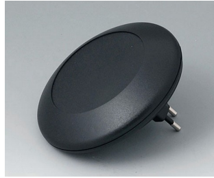
B5011229 ART-CASE R110 F PC+ABS (UL 94 V-0) black RAL 9005 ø110x38mm IP 40