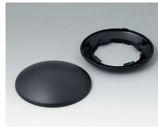
B5010109 Bottom and top part R110 H ABS (UL 94 HB) black RAL 9005 ø110x38mm