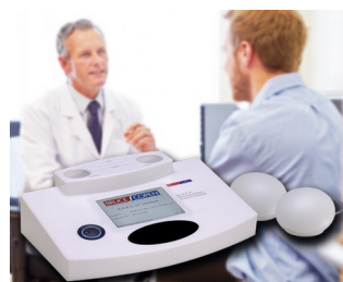
Multiple analytical resonance system