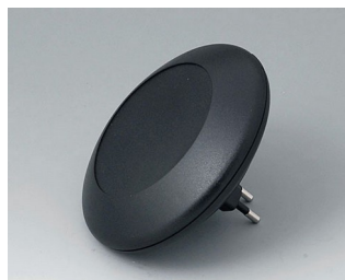
B5011029 ART-CASE R110 F PC+ABS (UL 94 V-0) black RAL 9005 ø110x30mm IP 40