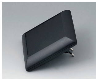
B5013229 ART-CASE S110 F PC+ABS (UL 94 V-0) black RAL 9005 110x110x38mm IP 40