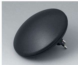
B5011329 ART-CASE R110 H PC+ABS (UL 94 V-0) black RAL 9005 ø110x41mm IP 40