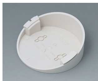
B5011217 Base 30° ABS (UL 94 HB) off-white RAL 9002