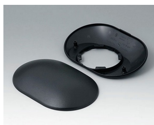
B5015309 Bottom and top part O160 H ABS (UL 94 HB) black RAL 9005 160x110x41mm