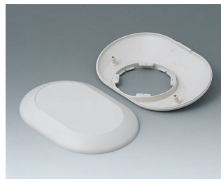
B5015207 Bottom and top part O160 F ABS (UL 94 HB) off-white RAL 9002 160x110x38mm